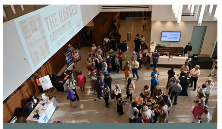
Visitors attend a screening of The Harvest at the Two Mississippi Museums.