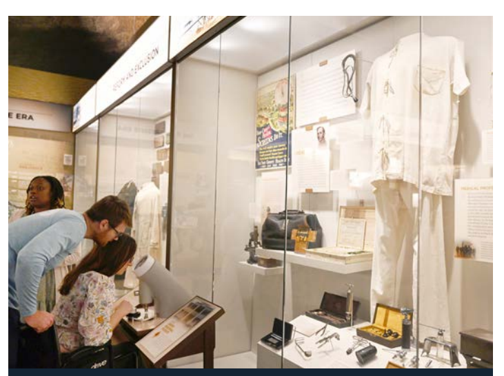
Visitors learn about Mississippi's medical history during a History Happy Hour tour at the Two Mississippi Museums.