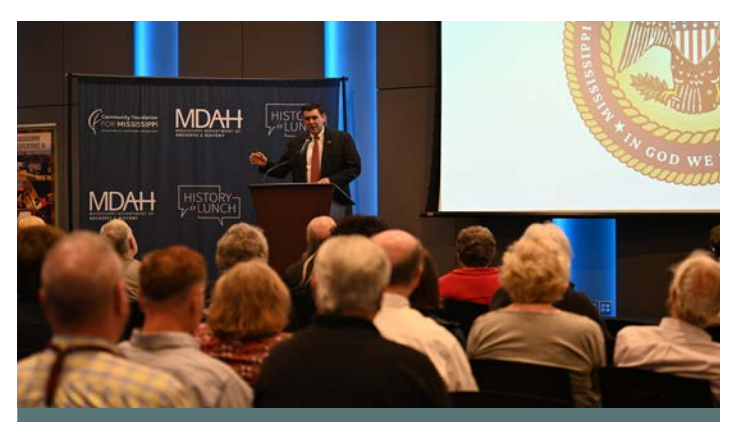
Commissioner Andy Gipson discusses the Department of Agriculture and Commmerce during History Is Lunch .