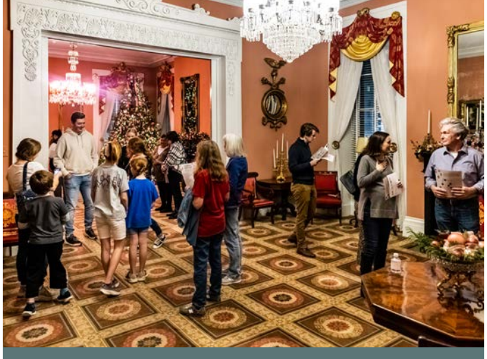
Visitors tour the Mississippi Governor's Mansion during Christmas By Candlelight.