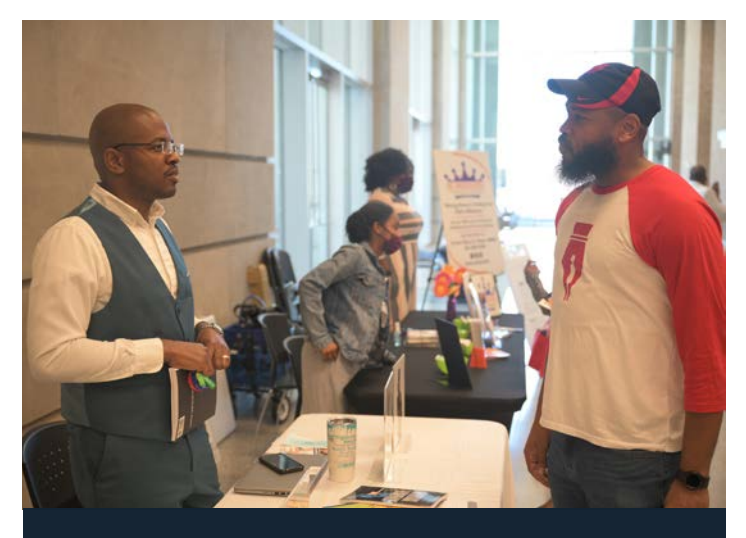
Visitors and presenters engage in conversation during the Entrepreneur Fair at the Two Mississippi Museums.