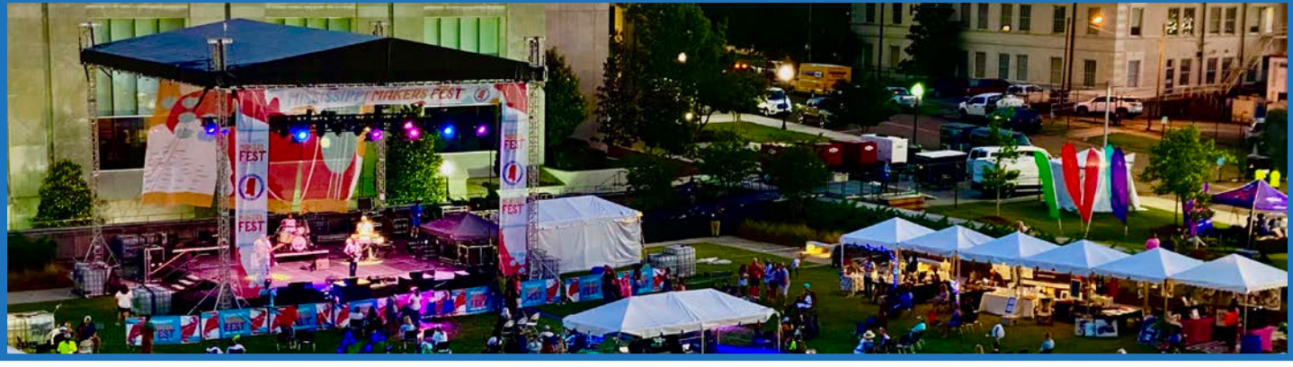
The first Mississippi Makers Fest brought over 3,000 peoople to the Two Mississippi Museums. Next year's date is set for May 13, 2023.