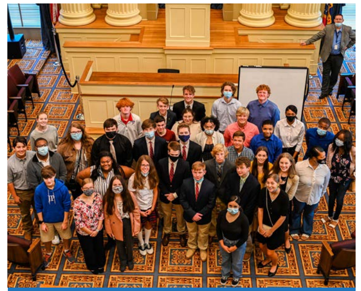
High school students gather in the House Chamber before competing against one another in the Old Capitol Bowl.