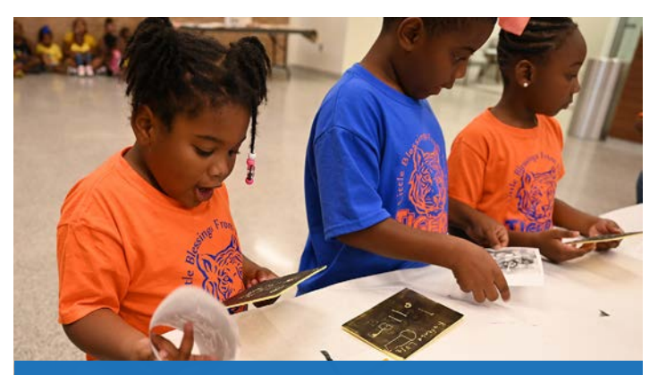
Children make prints during Field Trip Friday at the Two Mississippi Museums.