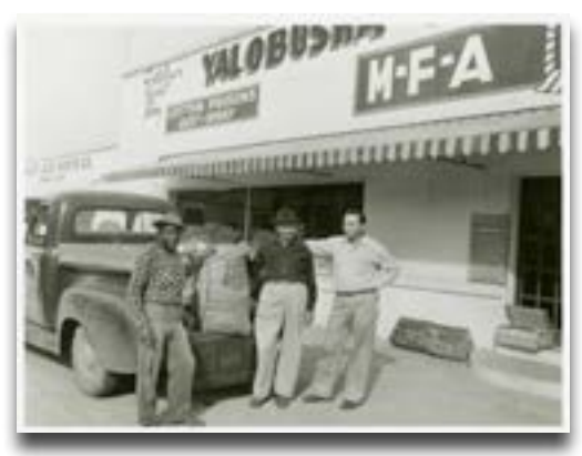
Yalobusha Co. Co-op, 1956, Water Valley, Mississippi.

Collection provides a unique overview of Mississippi farm practices and land use from the late nineteenth- through the early twenty-first centuries, as well as the effects of natural disasters on agriculture; health and safety issues