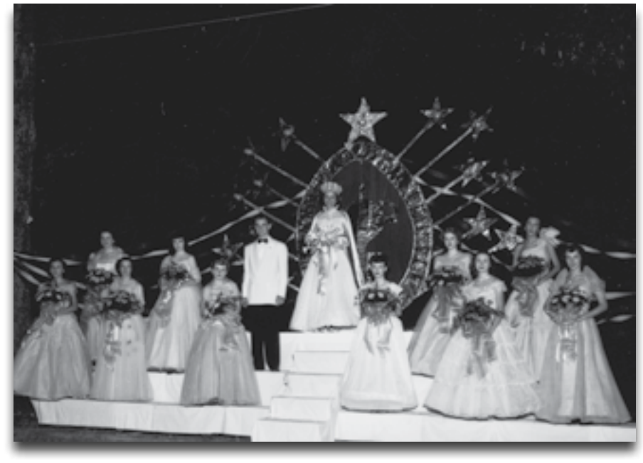
Whitworth College, Coronation Pageant, May 29, 1950. Queen stands atop decorated platform.

More than 3.700 photographs highlighting the state's rural and agricultural heritage have been added to the department's Web site. The Mississippi Farm Bureau Federation Collection and C.W. Witbeck Collection can now be viewed online through the MDAH Digital Archives. These photographs offer glimpses into everyday smalltown life as well as special occasions such as pageants and famous visitors.