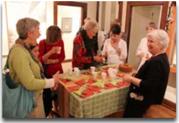
Visitors at the Eudora Welty House sample fruitcake made using the Welty family recipe.

The Old Capitol, Jackson's oldest building, was decked with greenery in the style used in 1840 when local women prepared the building for a visit by Andrew Jackson. Garlands hung around the rotunda railing on the second floor and the stairwells, and wreaths decorated the exterior of the building. The circa-1841 Mississippi Governor's Mansion was decorated with seasonal greenery.