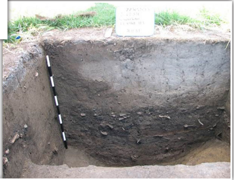
Refuse from feasting that took place near Mound F.

Mississippian beliefs, and Winterville's hierarchical society. What are conditions like for Winterville workers? Who would be invited to this Winterville gathering? What food would be served at this feast?