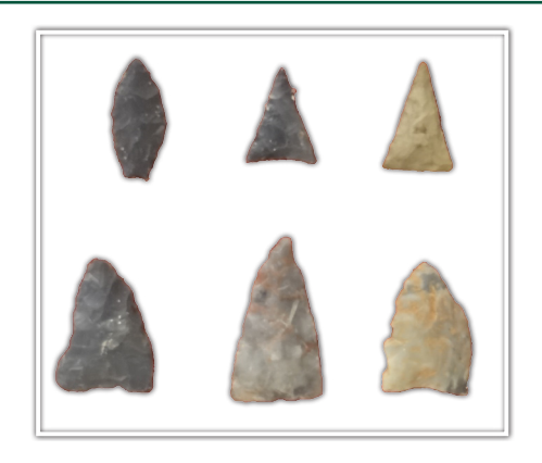
Arrowheads from the Winterville Mounds Museum

Students will have the opportunity to study exhibit text and artifacts on a standard field trip to Winterville. Some special programs allow students to handle replicas of artifacts. For more information about scheduling special programs as part of your visit, please see pages 25—26.