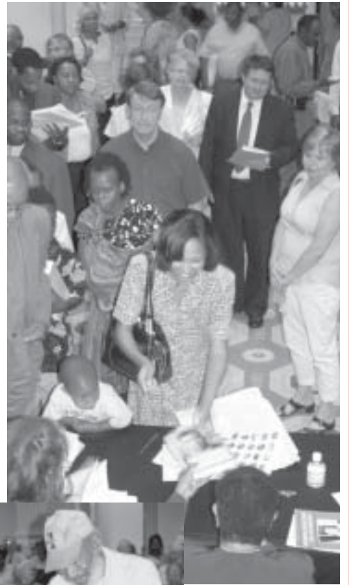
Left: Evers signs copy for James Meredith, who integrated the University of Mississippi in 1962.

On June 10 at the Old Capitol, Myrlie Evers-Williams read from The Autobiography of Medgar Evers and signed over one hundred copies of the new volume that she co-edited with Manning Marable, historian. Evers-Williams donated the Evers Papers to MDAH in 2002.