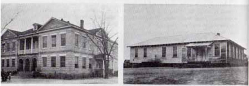
White school (left) and black school (right) in Tishomingo County about 1935.